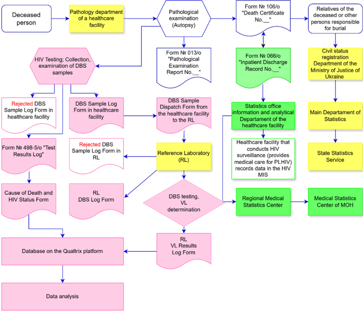
Fig. 4. Information flow on deceased individuals within the study "Analysis of the HIV Mortality Surveillance System and Hospital-based Monitoring of HIV-Associated Mortality in Ukraine."